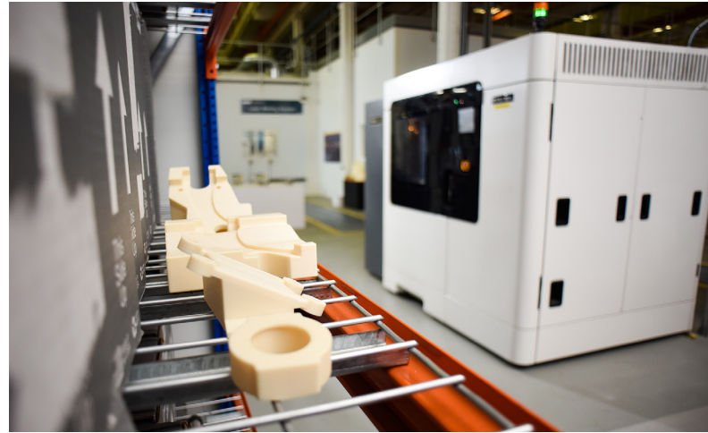
3D printed tooling produced on one of GKN Aerospace's 3D printers.

To achieve these goals GKN relies heavily on its Stratasys Fortus 900mc™ 3D Printer . "The Fortus 900mc offers the largest build size of any FDM® 3D printer, enabling us to quickly produce tools to meet any requirements. We're already utilizing this technology to design and 3D print previously inconceivable tools, which then enable us to manufacture extremely complex parts that would be uneconomical or just physically impossible by any other means," said Trimble.