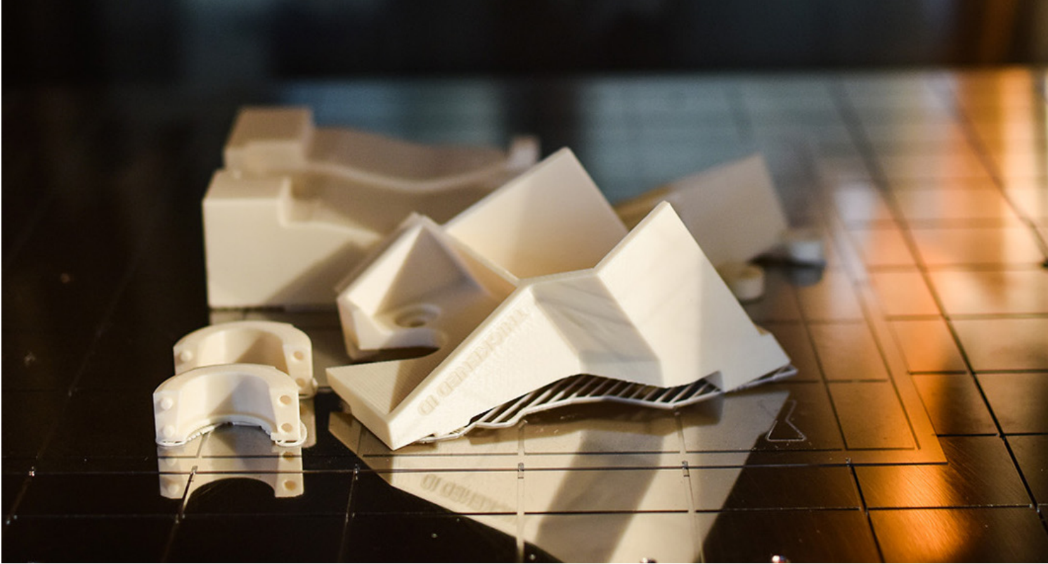
Examples of 3D printed fixtures that are uneconomical or impossible to make with other manufacturing methods.